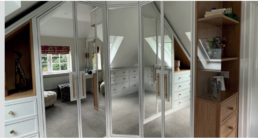
08/ JOINERY DESIGN Examples of our bespoke Joinery/ Upholstery Pieces