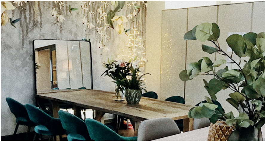
07/ FARMHOUSE KITCHEN The client wanted a fun and youth whymiscal farmhouse kitchen.